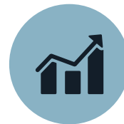
Insights and Analytics