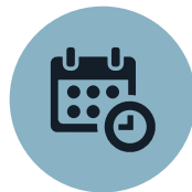
Route and Territory Overview and Planning